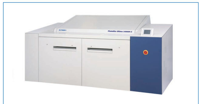
PlateRite Ultima 24000N Very large format CtP system