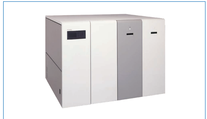
PlateRite 1080 SCREEN's first CtP system

Going forward, SCREEN GA intends to continue its work as a leading manufacturer of CtP systems by promoting the automation of production lines and developing further solutions to address specific customer issues. It expects these initiatives to lead to the creation of products that meet diverse market needs. At the same time, the company plans to accelerate its efforts targeting the development of a sustainable society, also allowing it to contribute to the long-term growth of the printing industry.