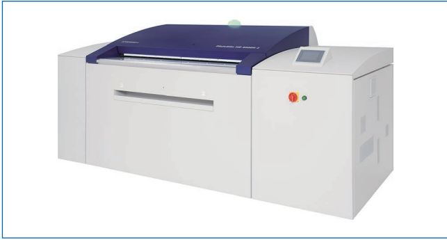
PlateRite HD 8900N Flagship 8-page CtP system