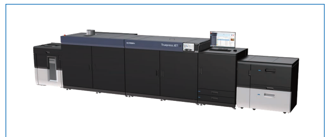
Truepress JET S320

With the introduction of this product, SCREEN GA is expanding various solutions, including the enhancement of workflow solutions integrated with our EQUIOS workflow system, hybrid printing in conjunction with CtP and offset printing, and increased productivity through the combined use of the Truepress JET 520 series.