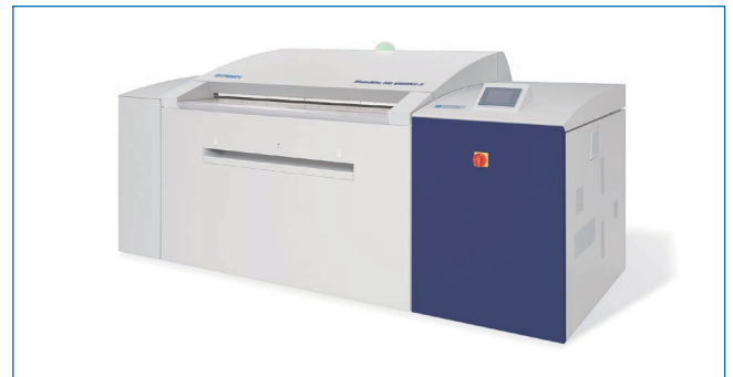
PlateRite HD 8900N II

As a leading manufacturer of CtP systems, SCREEN GA's upcoming launch of its new PlateRite HD 8900N II series is expected to make a major contribution to the continuing growth of the printing industry.