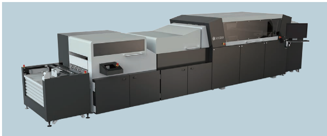
Scodix Ultra2 Pro with Foil

SCREEN GA will display and demonstrate the Scodix Ultra2 Pro with Foil, a Digital Enhancement Press, UV inkjet system with digital embossing and foil application capabilities. In addition to a wide range of Scodix samples showing customer successful case studies from around the world, visitors will be able to inspect various printed samples including newly developed holographic effects, thin embossed foil, showing all Scodix 9 applications including: Scodix Sense™, Scodix Foil™, Scodix VDE™, Scodix Metallic™, Scodix Glitter™, Scodix Braille™, Scodix Spot™, Scodix Crystal™, and Scodix Cast&Cure™.