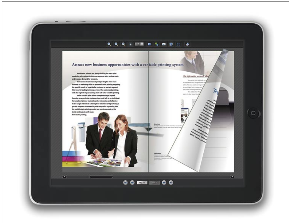
Book View (application image for tablet type device)

Please download the photos from http://www.screen.co.jp/press/nr-photo/indexE.html